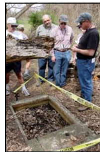
Portsmouth Asylum Well

We perform historical surveys of the site, provide educational outreach via Earth day and company picnic activities, reach out to local historical organizations, and reach out through our website to the genealogical community. We have become a major source of web-based historical information on American poor farms with linking and a three thumbs up review from www.poorhousestory.com .