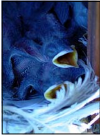
Tree Swallow Chicks

You may have noticed the addition of bird boxes, new trails, and people with binoculars and clipboards in the woods. Don't be alarmed! They're likely fellow employees participating in the Raytheon Employees Wildlife Habitat Committee (REWHC).