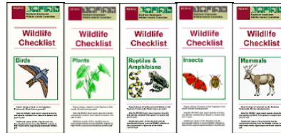
Wildlife Checklists Backed By On-Line Databases

causing their decline or destruction. At REWHC, we increase biodiversity through an aggressive bird nest monitoring program, the removal of invasive species such as bittersweet vines, the planting of wildflower, butterfly, and hummingbird gardens, and the controlled mowing in field where nesting could occur. Though our current focus is birds and plants, future plans include mammals, reptiles, amphibians, and insects. We have already created checklists and online databases for them.