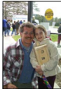
Nest Box Builders

Causes and effects influencing the environment are not always apparent to the casual observer. Becoming sensitized to the natural world allows us to become better environmental stewards. Understanding local history helps us better appreciate both the process under which our ecosystem was born, and any artifacts we may see along the trail. At REWHC, we create interpretive trails and provide guided trail walks to scouting groups, local organizations, and employees. We also provide training and involve fellow employees in our nest monitoring program. Earth day and the company picnic, are a focus for our outreach to fellow employees, but outreach occurs year-long through a host of programs and events.